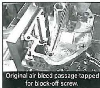
Original air bleed passage tapped for block-off screw.

5. Clamp Carb in vise upside down. Locate original internal air bleed hole (photo 5) to be blocked off. ('04 and earlier) Carefully drill this passage with a #21 (.159") drill bit until you break into cross passage in Carb body. Tap hole with a 10-32 tap, blow passage out with compressed air, then plug with supplied 10-32 slotted screw. ('05 and later) These carbs come with a main jet style air bleed jet; remove the jet and plug the hole with the supplied 5/16-24 set screw.