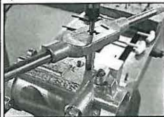
Tapping bowl vent for fitting.

1. Pressure in the float bowl is stabilized with the addition of this external bowl vent. Locate the new vent hole in the rear of the carb wall .438" above bowl gasket surface and 1.906" from the manifold flange of the carb. Open hole with a small center drill then plunge a 5/16" end mill to a depth of .562" below the raised surface. Use a 1/2" countersink to chamfer the raised surface to help start the tapping process. Chamfer only slightly not touching the lower level surface. Tap with 1/8" NPT tap. Install 1/8" NPT street elbow and 1/8" NPT x 3/8" hose nipple using a suitable thread sealer. The hose nipple should be positioned pointing up.