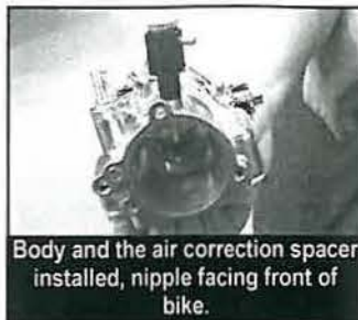
Body and the air correction spacer installed, nipple facing front of bike.

3. Remove jam nuts (no longer needed). Install the air correction spacer (small opening out), o-ring and ThunderJet body on to Carb. Fuel line nipple should point to front of bike and slightly toward the air filter for hose routing. Trim small opening side of air correction spacer, if needed, to achieve a hand tight location 1/6 of a turn from permanent location and finish tightening with wrench. (.006" trim = 1/6 turn). DO NOT OVERTIGHTEN BODY OR FUEL TUBE BREAKAGE WILL RESULT!!