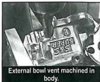
External bowl vent machined in body.

6. We have found additional performance and increased fuel pressure stability in the float bowl by relocating and modifying the float bowl vent passage. Clamp body upside down at a 45 degree angle. Remove the existing 5/16" bowl vent plug (photo 6). Using a small center drill or wiggler, locate the center of the hole where plug was removed. Mark a spot 7/16" from the casting surface where vent plug was removed, toward top of Carb. Using a small center drill, break through to existing vent passage. Finish hole using a 5/16" 2-flute end mill at this angle. Cut only deep enough to enter existing vent cross drill!