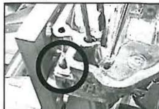
Remove bowl vent passage plug.

the vent and uncontrollably richen the mixture. Install the plug just deep enough to be slightly below the air filter mounting surface, and use Loctite. If you choose not to do this modification, at least remove the vent plug and discard it.