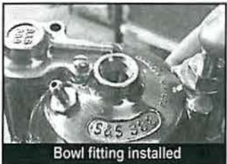
Bowl fitting installed

8. Thoroughly clean Carb, check low speed and main jet sizes for engine compatibility (see tuning tips), re-assemble Carb and install fuel line with clamps provided. Fuel hose is routed to front of bike. See tuning instruction page for jetting instructions.