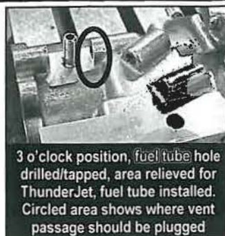
3 o'clock position, fuel tube hole drilled/tapped, area relieved for ThunderJet, fuel tube installed. Circled area shows where vent passage should be plugged

8. You then need to relieve the area around the hole you just threaded for air bleed spacer clearance. This is best accomplished on a vertical mill with a 3/4" end mill, on center of your threaded hole. Be certain to leave .170-.185" of carb wall for the short threaded portion of the fuel delivery tube. (On a "B" carb with twin ThunderJets, you will be cutting through the float bowl vent passage. This passage must then be plugged, as its location will subject the passage to positive air pressure at speed, resulting in fluctuating pressure in the float bowl, adversely affecting jetting. Drill the passage past the ThunderJet mounting area and tap it 5/16", 3/8" deep and plug it with a set screw. The external vent described in step 1 must be performed to replace this original vent.)