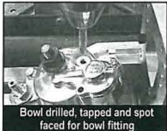
Bowl drilled, tapped and spot faced for bowl fitting

7. Remove float from bowl. Set bowl at a 20 degree angle on sine plate. Drill a #3 hole between bowl drain plug and accelerator pump housing and tap with 1/4"-28 tap. Spot face hole center (kiss) just enough to give a flat surface for o-ring to seal against (photo 8). Install fuel nipple and o-ring, secure inside bowl with lock washer and nut provided (photo 9). Make sure this device does not interfere with float action.