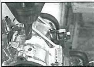
Drilled, tapped and spot faced for fuel delivery tube.

1. Loosen the drain nut and remove your float bowl from the Carb. Remove emulsion tube with main jet from Carb body and remove the accelerator pump rod, rubber bellows and discharge o-ring. Looking into Carb throat, turn Carb counter-clockwise at approximately an 11 degree angle and clamp in vice.