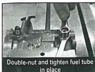
Double-nut and tighten fuel tube in place

5. Install the fuel delivery tube from the inside of the carburetor throat out. Double nut the delivery tube using (2) 1/4-28 jam nuts and carefully lock into carb throat ( DO NOT OVERTIGHTEN ). Remove jam nuts (not needed after this step).