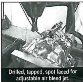
Drilled, tapped, spot faced for adjustable air bleed jet.

4. Locate air bleed passage plug above S&S nameplate on throttle spool side of Carb. Clamp Carb body at approximately a 45 degree angle. Center a 5/16" end mill over the plug and spot face lightly to flatten and align. Use a center drill to start and then drill the plug with a #19 drill bit and tap 5mm x .8mm for air bleed (photo 4). Install air bleed jet (same type jet used in ThunderJet). Jet sizes range from 130-170 for most applications (see chart).