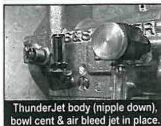
ThunderJet body (nipple down), bowl cent & air bleed jet in place.

DO NOT OVERTIGHTEN BODY OR FUEL TUBE BREAKAGE WILL RESULT!