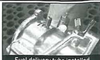
Fuel delivery tube installed.

3. Install the fuel delivery tube from the inside of the Carb throat out (photo 2). Using (2) 1/4"-28 jam nuts, double-nut the fuel delivery tube outside of the Carb throat and carefully lock tube into Carb throat until all or most of the air bleed segment is exposed.