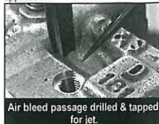
Air bleed passage drilled & tapped for jet.

2. All "B" model carbs are manufactured with a fixed size air bleed passage. This modification will allow the tuner to adjust the main jet air bleed size for more control over the main jet circuit signal timing and fuel volume. Locate the fixed air bleed hole and bore with 1/4" drill until you reach the cross drill in carb ( DO NOT GO PAST CROSS DRILL!! ). Spot face the area with 1/2" end mill for mating surface of jet. Use 5/16-24 starter tap in hole and remove to use a 5/16" bottom tap to finish job. Original air bleed size is .042"; suggested range is .054-.072". Use S&S main jets for this application.