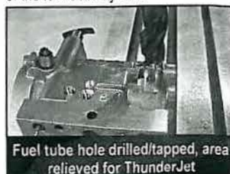
Fuel tube hole drilled/tapped, area relieved for ThunderJet

4. You then need to relieve the area around the hole you just threaded for air bleed spacer clearance. This is best accomplished on a vertical mill with a 3/4" end mill. With the cutter starting near the bowl area, mill toward the top of the carb, removing material at least 1/4" above the centerline of the fuel tube hole. Use care not to break into the enricher air passage located above the hole. Leave .170-.185" of carb wall for the short threaded portion of the fuel delivery tube.