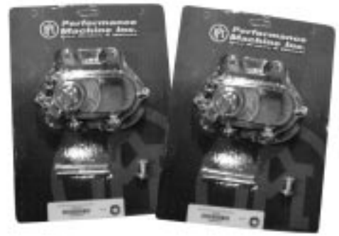
PM CONTOUR CLUTCH HOUSING . AVAILABLE IN SMOOTH AND FLUTED DESIGN .

Photo 3: Re-install thrust washers, throw out bearing and retainer ring.