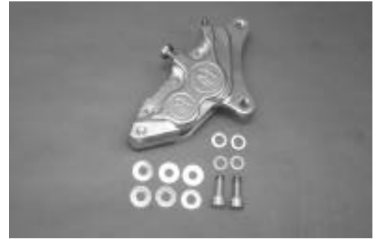
Bolt-On Caliper Kit

Using a 5/16" hex wrench, remove the two mounting bolts from the stock caliper, see Photo #1. Remove the caliper from the fork leg and reinstall the lower mounting bolt into the stock caliper, this will keep the outer brake pad carrier from falling out. Using a short piece of wire, hang the stock caliper up out of your working area, see Photo #2. Tape or zip tie the handle bar master cylinder lever 1" from the handle bar. This will prevent excessive fluid loss when removing brake line at caliper. Do not remove line yet.