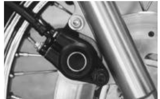
Stock Caliper Assembly